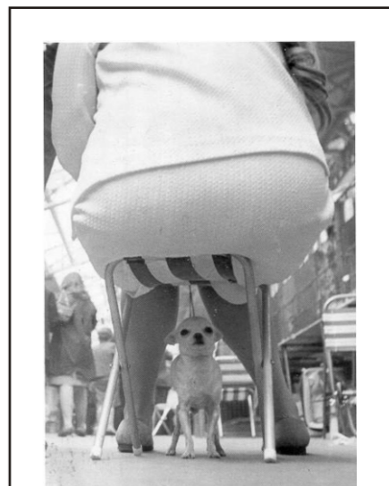
Spot the hazard!